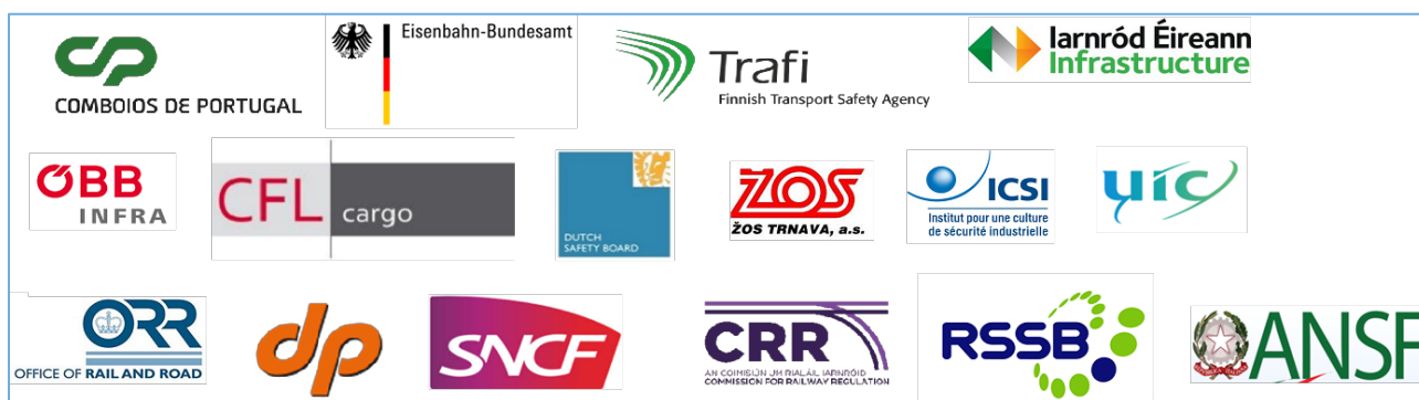
Figure 1: Ad Hoc Task Force on Railway Safety Culture Assessment: Participating Organisations

The composition of the ad-hoc task force aimed at reflecting the diversity of organisations involved in the EU railway sector. Representatives from the organisations in Figure 1 participated in the task force and met three times during April and September 2018. The meetings relied on interactive working methods to foster exchanges between the members.