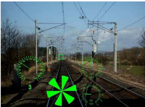
Figure 7 – Heads Up Display

A major challenge faced by designers is how to integrate various complex operating and traffic control outputs into a meaningful arrangement. Presenting the operator with many busy display screens might cause them to spend too much time in a “head down position” monitoring the various systems rather than looking out the window observing signal aspects watching for level/grade crossings, trespassers, etc.