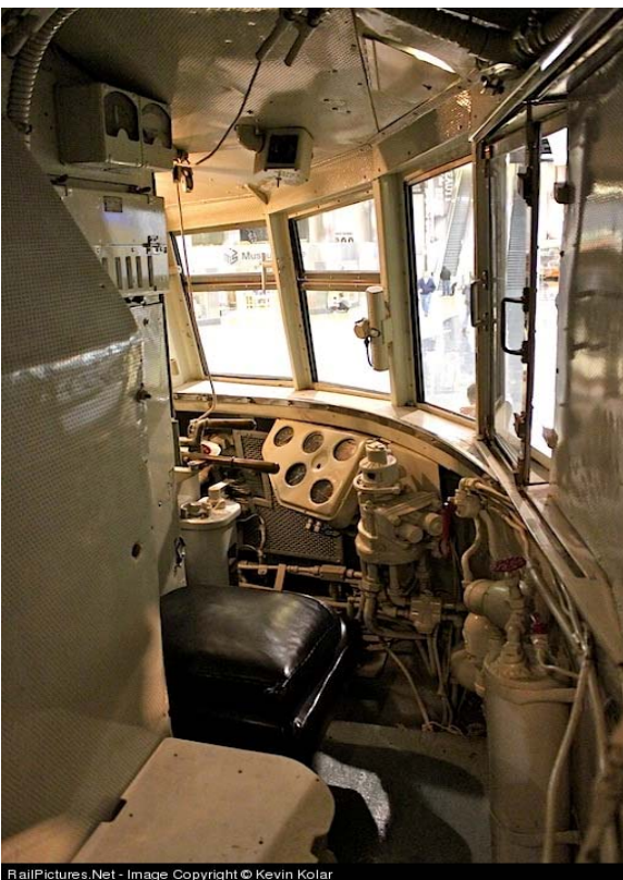
Figure 3 - 1934 EMC Diesel Electric Locomotive - Chicago Burlington & Quincy Railroad Used with Permission

Forward visibility in this locomotive was a significant improvement over steam locomotives with their long boilers. Locomotive like this one operated until the early 1970's and in their later years were equipped with windshield wipers and a rubber-mounted window in a steel frame instead of the wooden sash.