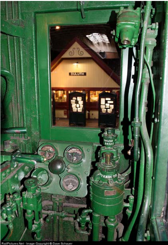
Figure 2 – 1915 GE Electric Locomotive - Chicago, Milwaukee, St. Paul and Pacific Railroad Used with Permission

In this electric locomotive cab from 1915 the controls follow contemporary steam locomotive design. The various controls were placed wherever most logical from a manufacturing perspective. A brake valve, for example, was located near to where its piping entered the cab with little thought as to the relationship of the throttle and brake handles (or the engineer's knees). However one can see beginning efforts to instil some order into the design. Note the group of gauges placed together and illuminated by a light bulb underneath the round black cover.