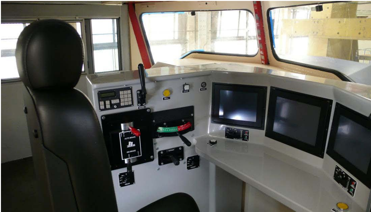
Figure 8 - A Mock-up of a Possible New Design See Source Below (Control Stand Final Report)

Aside from different approaches to displaying data, technology also presents an opportunity to explore different approaches to the design of switches and controls. Above is a photograph of a mock-up design that may point the way to tomorrow's locomotive cabs. Here the throttle and dynamic brake are now operated by the same lever. A similar arrangement is already installed in a large number of North American locomotives that have a desk top control arrangement so this proposal would probably not require a major adjustment for today's operators. However, designers may want to take advantage of today's technology where the major controls such as the throttle and brake no longer operate large mechanical or electro pneumatic controls. These have been replaced by smaller electric switches; a small "joystick" installed in a seat arm could now perform the same function.