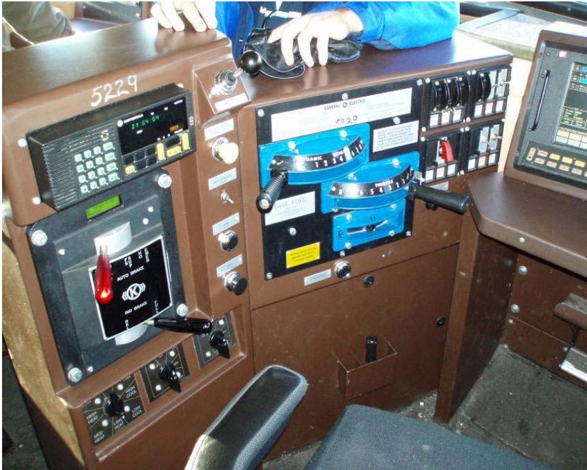
Figure 6 – An Example of Current Cab Design See Source Below (Control Stand Final Report)

This GE locomotive is an example of current production still showing the main features of the 1972 AAR Clean Cab design. The dynamic brake and throttle handles are separate and have different shapes so they can be readily identified in the dark and they move in opposite directions. Analog gauges have been replaced by video screens; the top of the control stand where the man is leaning has been lowered to increase visibility to the left side of the cab and out the window. Various other devices such as the radio are recessed into the control stand or in the area above the windshield (not seen in this picture).